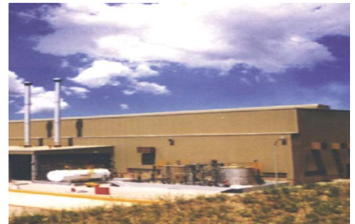
Tuff Span Roofing & Siding - 44,594 SM; Tuff Span Monitor Ridge Vent - 366 LM