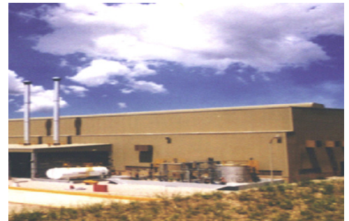
Tuff Span Roofing & Siding - 480,000 SF; Tuff Span Monitor Ridge Vent - 1,200 LF