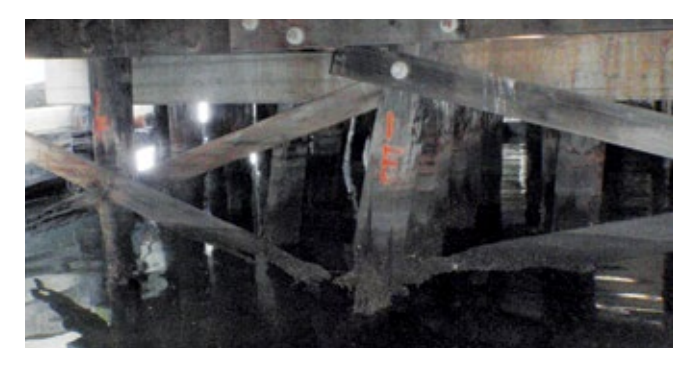
Not Susceptible To Marine Borers

SuperLoc is inert and will not leach dangerous chemicals into the environment.