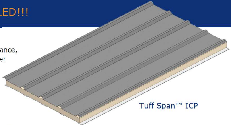
Tuff Span™ ICP

With a proven history of outstanding product performance, Tuff Span™ FRP roofing and siding is the market leader providing safe, weathertight, long-term building solutions in the most chemically aggressive and harsh environments. The Tuff Span technology utilizes premium raw materials and constructability designed to achieve the highest performance.